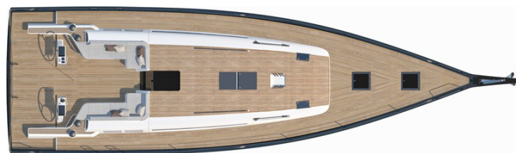
3 cabins 2 heads version: