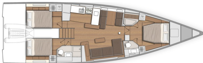
3 cabins 3 heads - Skipper's cabin version: